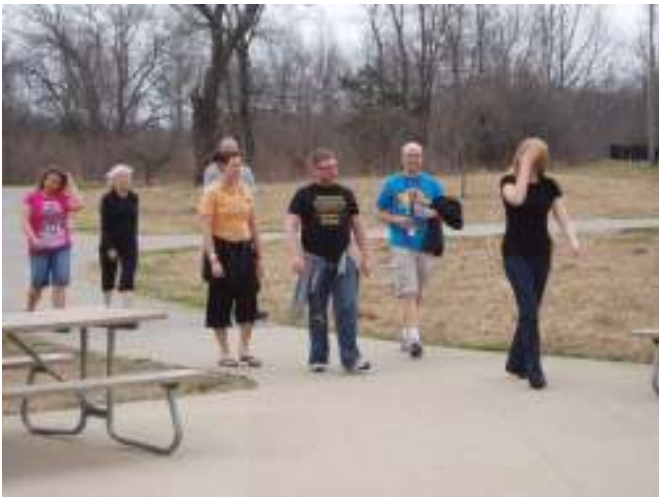
Staff returning from a wellness activity.