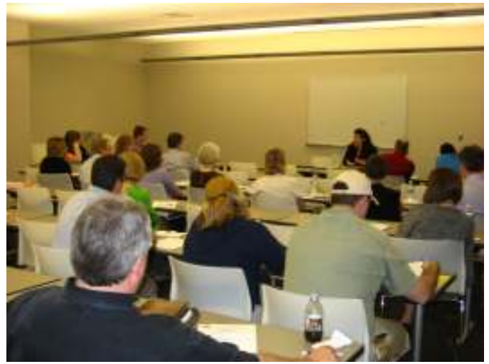
JCPH staff and community partners discuss H1N1 tactics.