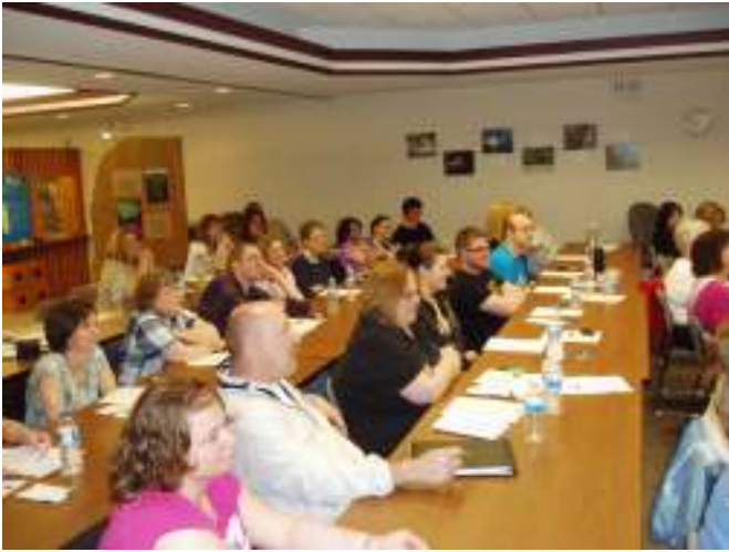
Public Health employees at Annual Staff Retreat held at Kent Park Education Center.